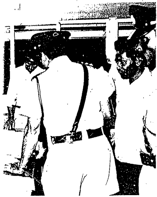
ated throughout Solomon Islands on August 6,7,8 and 9.