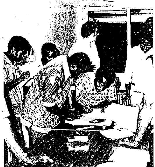
Counting votes in West Honiara - a scene repeated throughout